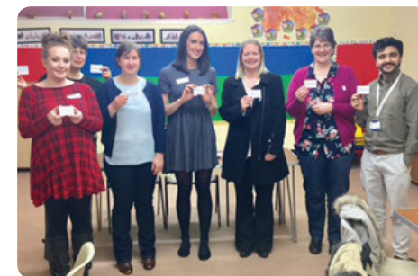
Miscarriage Information Support Service (MISS) launch event after receiving funds on 28th of February at Danestone community centre.

The Aberdeen Health and Social Care Partnership are pleased to announce that approximately £61,000 has been allocated through the Neighbourhood Health Fund to 44 different projects across the city.